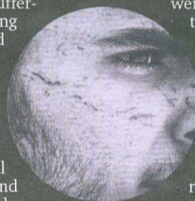
Captured Insurgent in Baghdad

I think that our filmmaking in Iraq and Afghanistan would have been suicidal if it was not for the presence of our security contractors who we had hired, especially in Iraq where we could hear gunfire and bombs going off. In Afghanistan there was one time when we had to flee a village where heroin was being farmed as our informer told us that the Taliban were on their way there to kidnap us. On another note however, I don't know exactly how dangerous or not these trips were really because there is also that much spin around the danger element, especially when you are far way and there's no way of corroborating what 'those people' were really up to.