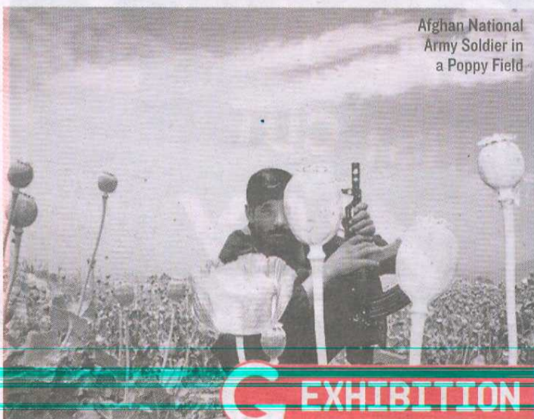
Afghan National Army Soldier in a Poppy Field