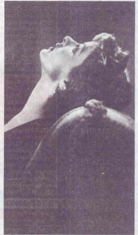
Ingrid Bergman: Shot by Robert Capa, the much-acclaimed photographer who met the Swedish bombshell in Europe. The duo shared a brief romance