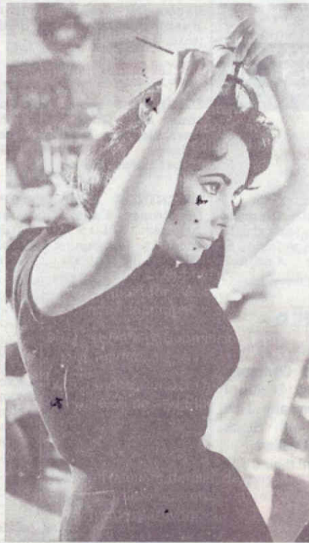
Elizabeth Taylor: Photographed by Burt Glinn at age 25 on the sets of 1959 flick, Suddenly Last Summer