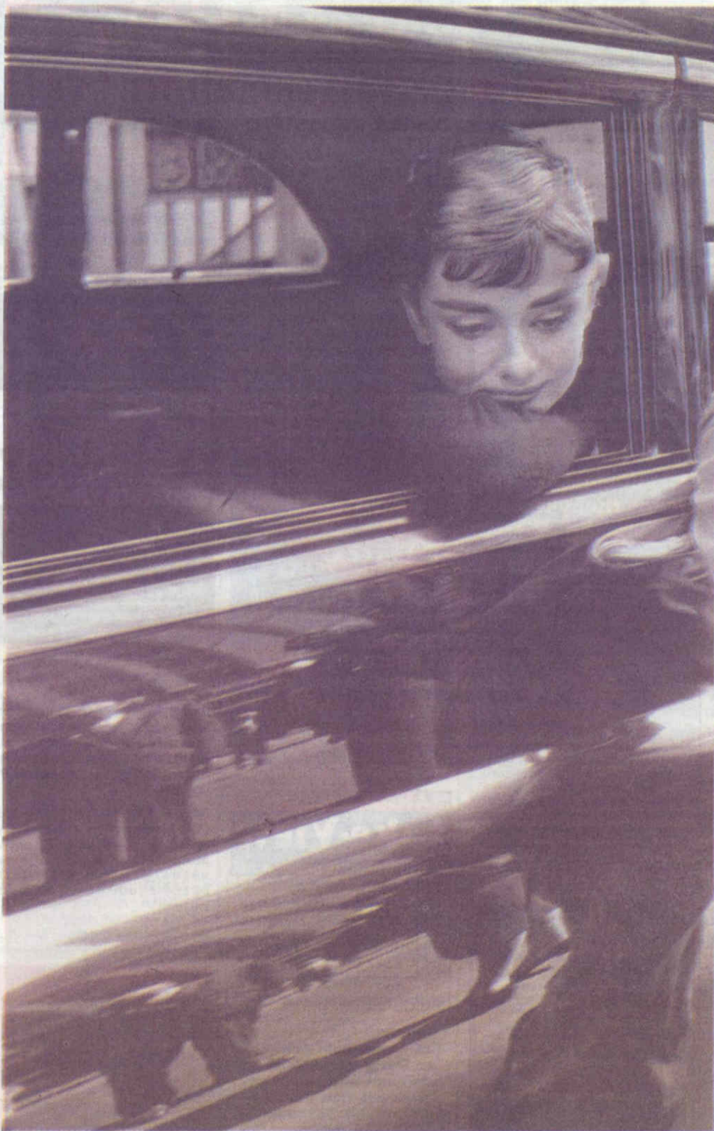
Audrey Hepburn: Shot by Dennis Stock during the filming of Sabrina, in 1954. Signed by Stock, rare copies of this image will be up for sale at the exhibition

Magnum Ke Tasveer: At The Movies will be on from October 29 to November 8 at ICIA House, 22/26, K Dubhash Marg, Kala Ghoda. Call: 22048138 / 22048139